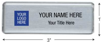
Medium (MD): 1.00 x 3.00"