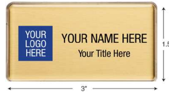
Medium Plus (MP): 1.50 x 3.00"